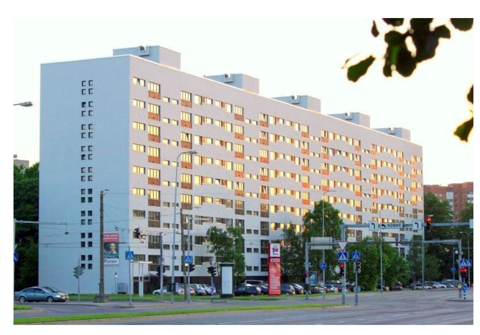
Renovated apartment building in Estonia